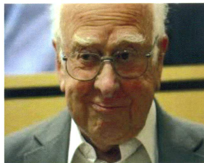
Prof. P W Higgs

CERN announced on 4 th July 2012 that they had experimentally established the existence of a Higgs-like boson or God Particle. The announcement marked a milestone in the history of Quantum Physics – God Particle, had been discovered. The particle shares its name with Satyendra Nath Bose and Peter Ware Higgs. Higgs is a British theoretical physicist and emeritus professor at the University of Edinburgh. He is best known for his proposal of broken symmetry in electroweak theory, explaining the origin of mass of elementary particles in general and of the W and Z bosons in particular. This so-called Higgs mechanism, which was proposed by several physicists besides Higgs at about the same time, predicts the existence of a new particle, the Higgs boson (which was often described as "the most sought-after particle in modern physics", and popularly known as "God Particle").